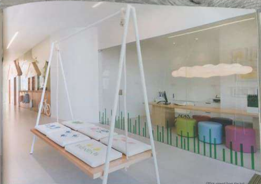
Office viewed from the hall