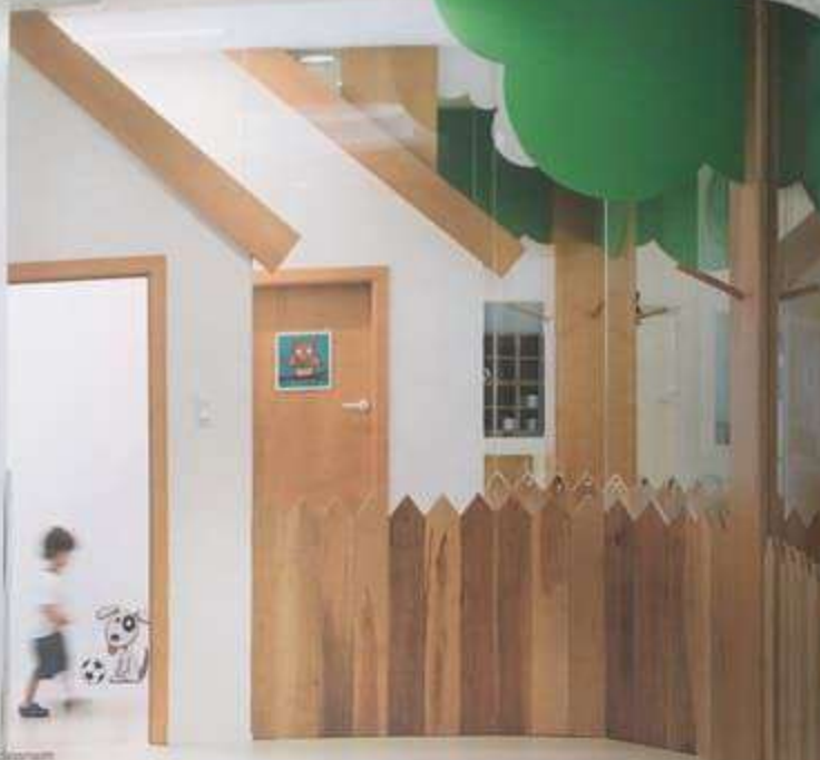
Entrance of psychomotor classroom