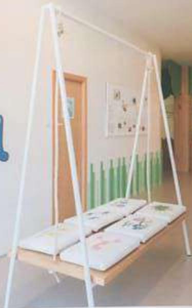
Viewed from the entrance